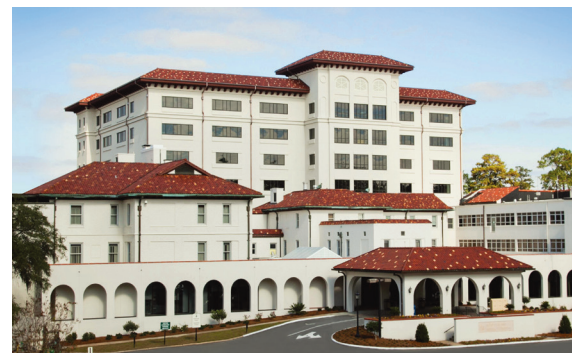
John D. Archbold Memorial Hospital Thomasville, Georgia

One reason Archbold selected Omnicell was a shared vision for the future and direct engagement that led to a strong relationship. As the partnership grew, Archbold’s feedback helped shape future programs and products offered by Omnicell.