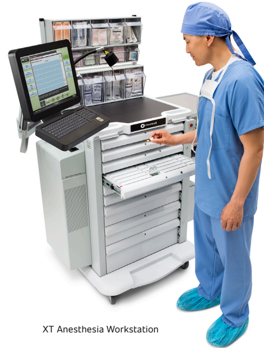
XT Anesthesia Workstation