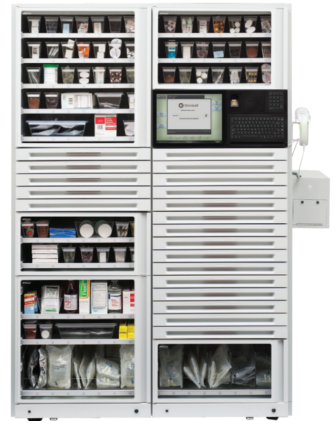
Two-Cell XT Automated Dispensing Cabinet