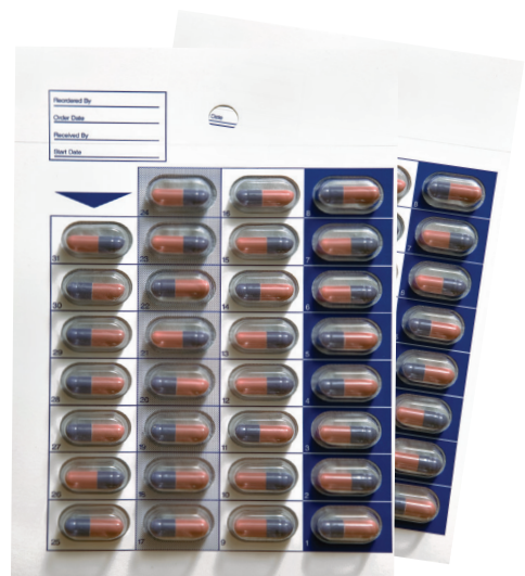
31-day Dose (Item# 300-58) (31 large blisters - Item #200-34)