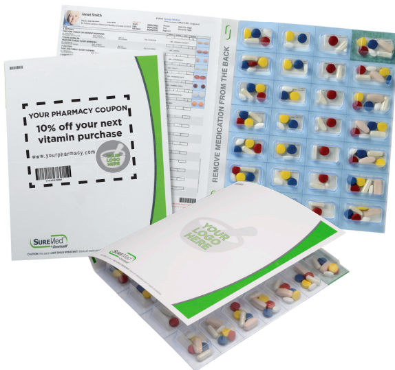
SureMed Co-Branded Card